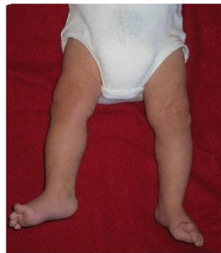
legs feet toes